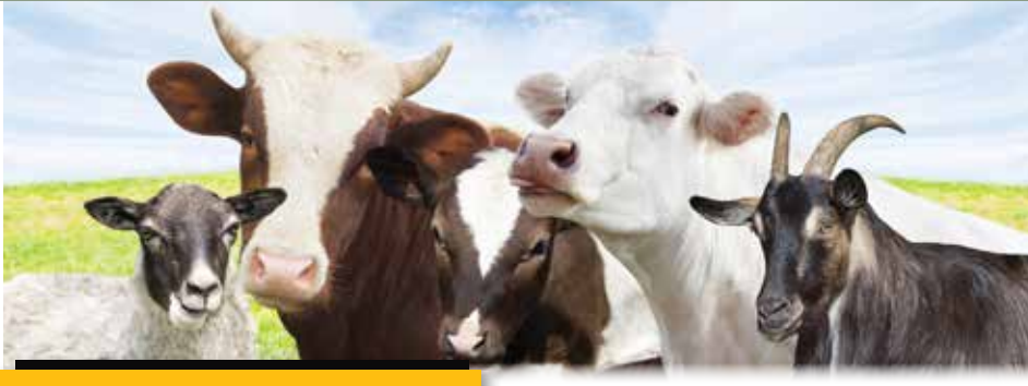
All Livestock Supplies Goat, Sheep, Cow, Alpaca, Llama, and Poultry Supplies.